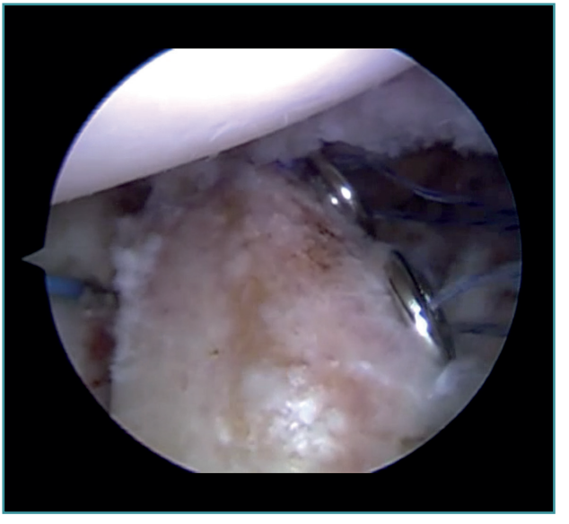
Figure 4. View from the posterior portal (left shoulder). Insertion of the graft by means of the traction threads and positioning in line with the bone defect.

The cannula is removed from the anterior portal, from the posterior viewing portal, rotator interval is widened