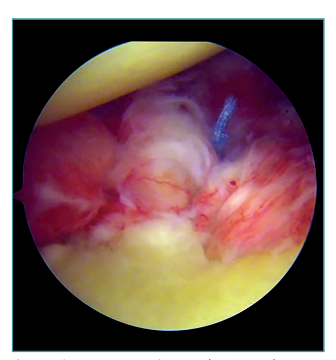
Figure 5. View from the posterior portal (left shoulder). Capsulolabral repair by means of glenoid implants, leaving the graft in an extra-articular position.

After confirming the correct position and stability of the graft, capsulolabral tissues are repaired using glenoid implants, leaving the graft extra-articular.